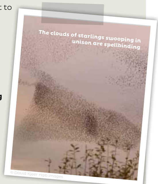
The clouds of starlings swooping in unison are spellbinding

Wildfowl flocks gathering, bitterns on the ice, flocks of thousands of waders on the Bay