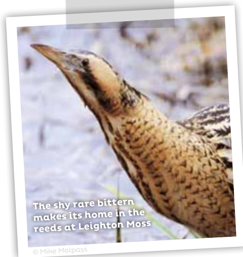
The shy rare bittern makes its home in the reeds at Leighton Moss