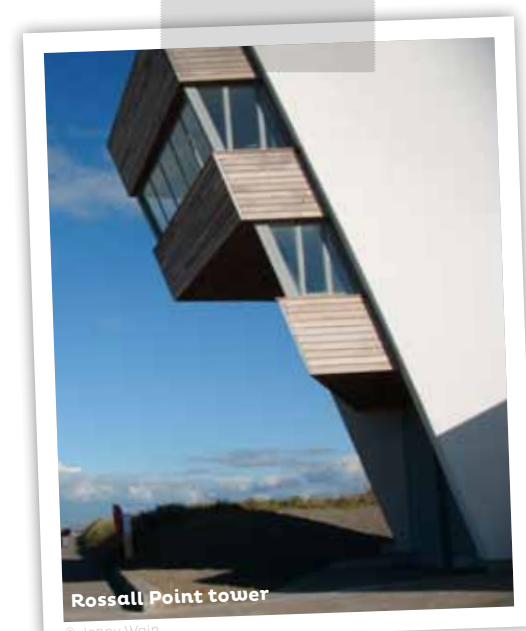
Rossall Point tower