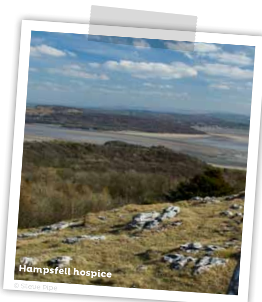
Hampsfell hospice

The River Wyre and Rossall Point mark the southern boundary of Morecambe Bay. The marshes, sands and muds are feeding grounds for many birds, and particularly pink footed geese, as they winter here before making their long journey back to Iceland and Greenland to breed. They are a noisy bunch, they make a medley of high-pitched honking calls as they fly. Large skeins (flocks) are almost deafening!